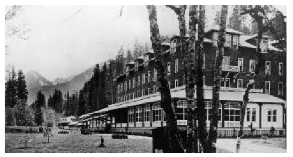
The four-star hotel at Sol Duc Hot Springs, circa 1914.

would be significant. The typical geothermal power plant operates at full capacity about 95% of the time. This means that 300 MW could produce about 2.5 billion kilowatt-hours of electricity a year — enough to provide more than 265 thousand average U.S. homes with electricity.