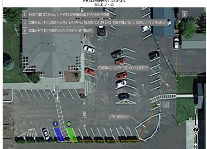
Sample EV parking and charging layout

As part of the information gathering task, the team will complete the Site Assessment form as shown in Appendix A. Prepare to meet with the local utility, EVSE vendors, and contractors with electrical system information, photos, and preliminary plans for charging equipment location.