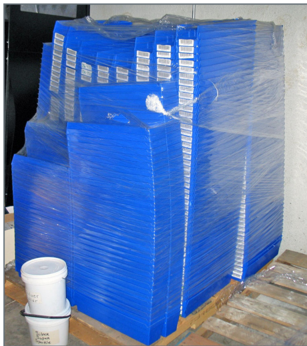
Several members were able to obtain mini storage bins.

If that weren't enough, a member in British Columbia was also among the first to respond to announcements of the availability of the bins. Delta School District #37 is south of Vancouver, B.C., and also wasn't able to make a five-hour journey to Fife to pick them up. So the Soldier's Home delivered an extra pallet to Oak Harbor School District, where it