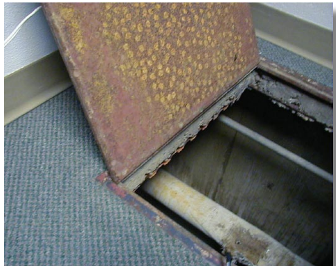
Keep tunnels, crawlspaces, and other areas containing contaminants under negative pressure compared to occupied.

Left: Other potential indoor air contaminants in these areas can include radon, pesticides, rodents, insects, molds, soil gas, moisture, and other pollutants.