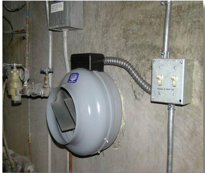
Exhaust fan in tunnel maintains "clean to dirty" air flow, preventing exposures to occupants in classrooms above.

In the Winter 2008 issue of IAQ News we discussed the principle of maintaining "Clean to Dirty" air flow direction as a useful mantra for any facility manager. With "Clean to Dirty" in mind, check each potentially undesirable zone with your chemical smoke tube to ensure airflow is from the occupied area to the problem area and then outside. If not, then look for an outside wall in the problem area through which you can punch an exhaust fan for depressurization and isolation of the contamination. 🚪