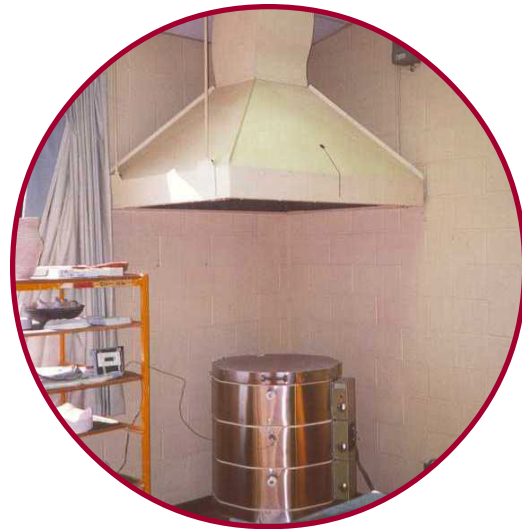
Planned exhaust to remove potential pollutants directly outdoors is recommended for equipment like kilns, laminators, darkrooms, and busy photocopiers.

More information about Indoor Air Quality is available on the Internet: